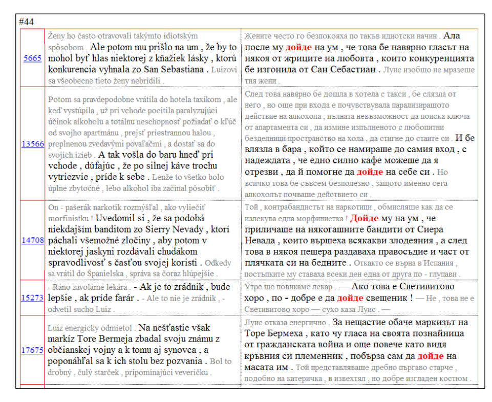
Fig. 2. Concordances of the Bulgarian wordform doŭde in the corpus

The result of the request execution (some of the concordances of the wordform doŭde of Bulgarian verb doŭda /come, arrive/) follow at the Fig. 2 :